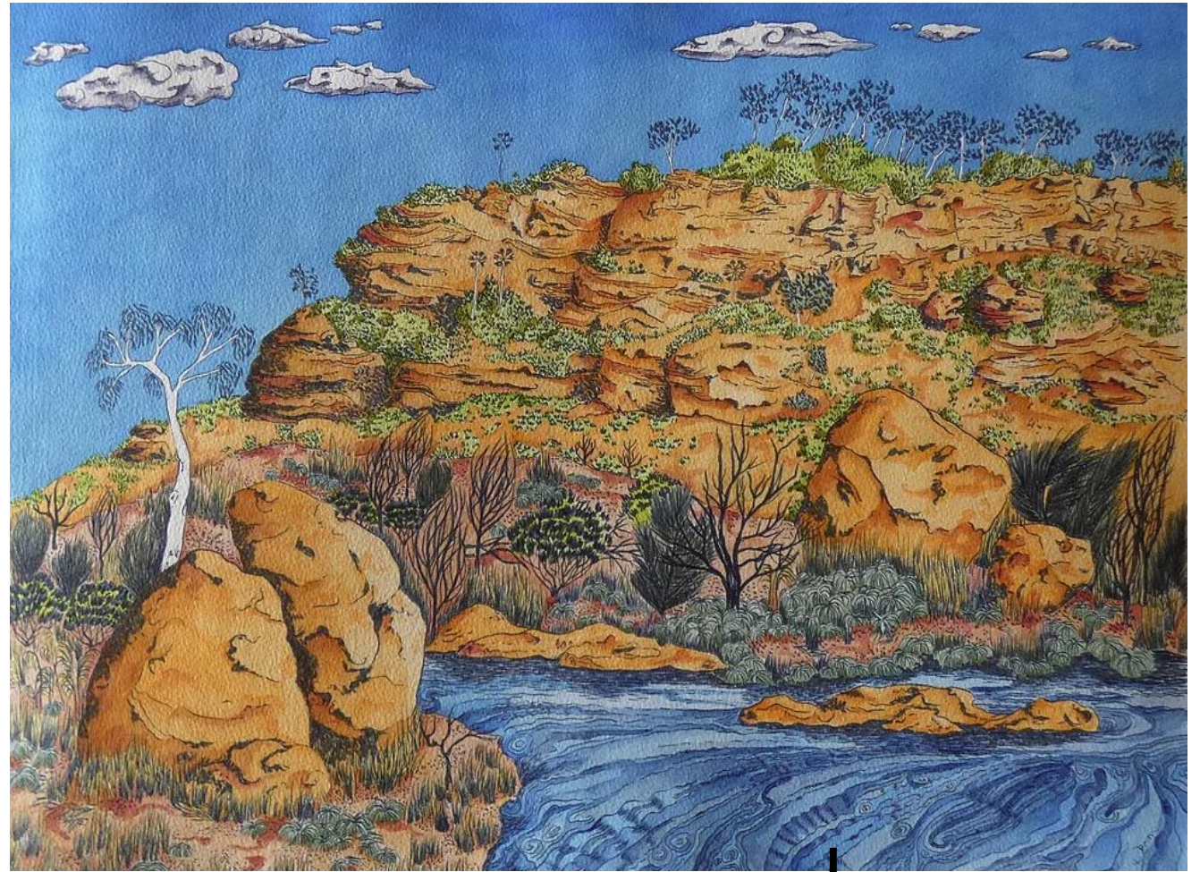
Kimberley Escarpments | Ink and watercolour