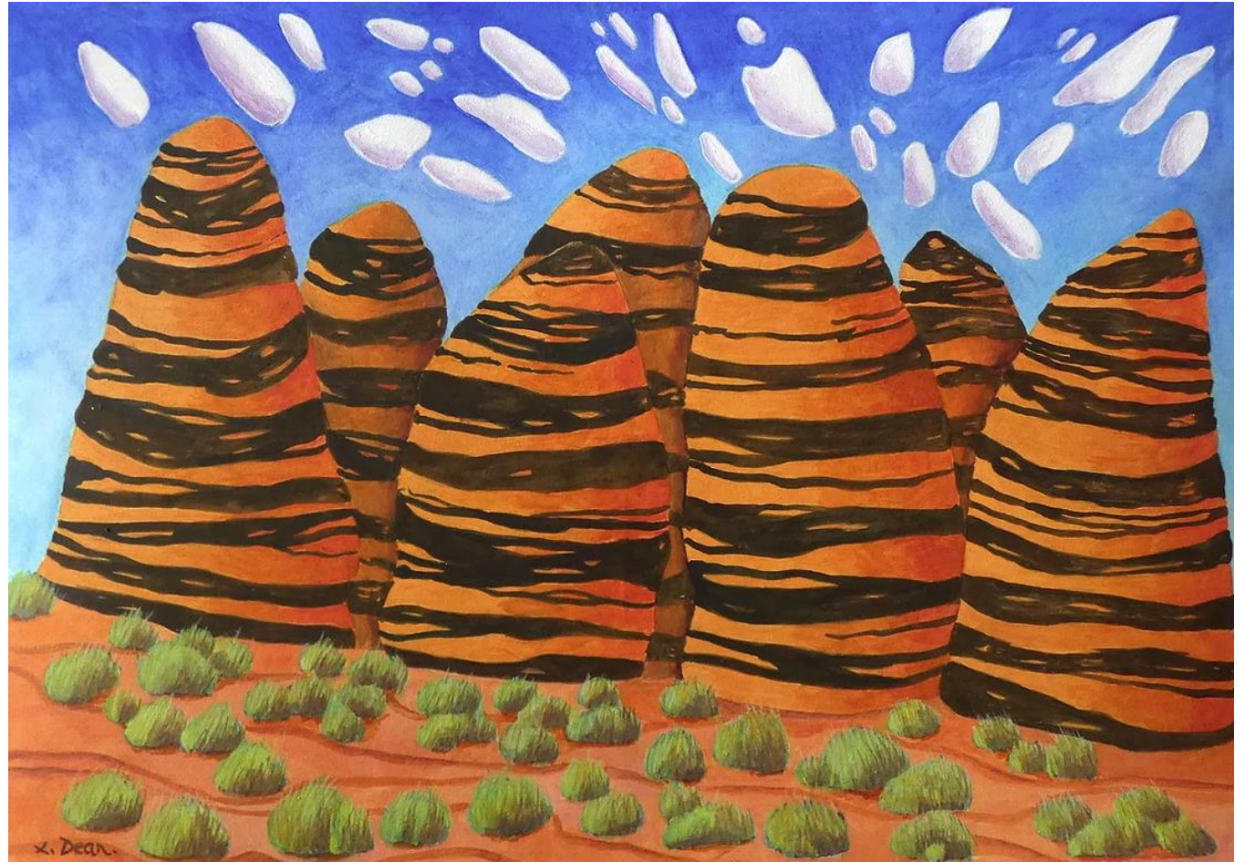
Hot Day at the Bungles | Gouache