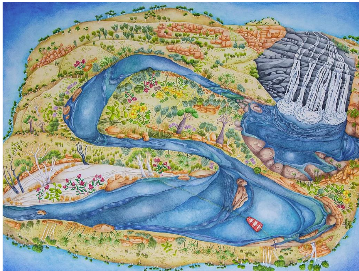
Manning Gorge | Watercolour

Draw the different types of lines that you see in the spaces below: