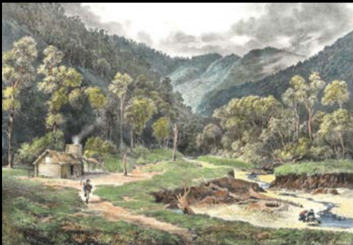
Wentworth River Diggings, Chromolithography 1864