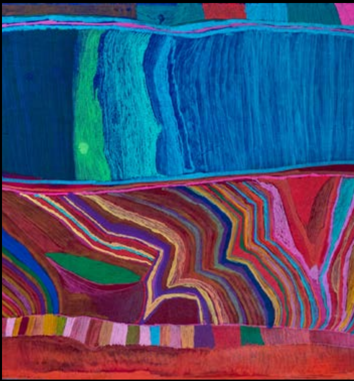
Glenn Sinclair Sunset on the Ocean , Acrylic on canvas (Colour Gang)